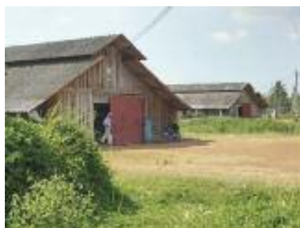
Hubbard broiler trial facilities in Thailand.

Methods to reduce the ambient temperature such as insulation, fans, evaporative cooling and reduced stocking density, can be