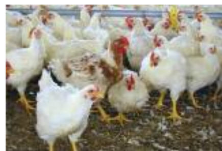
Hubbard JA 757 broilers.

This is not a new situation for broiler producers around the world, but the external pressures on the poultry industry are con-