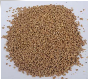
Fig. 8 – Chick starter crumble