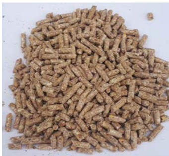
Fig. 9 – Good pellet feed