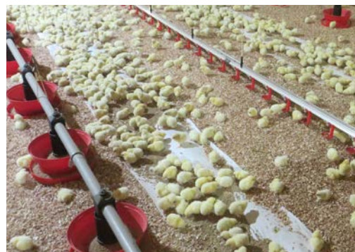
Fig. 6 – Feed on paper at start

>> Water is very important as broilers will drink 1.6 to 2 times as much as they eat, depending on age and watering system.