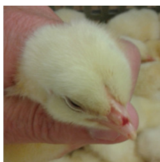
Fig. 2 – Red spot