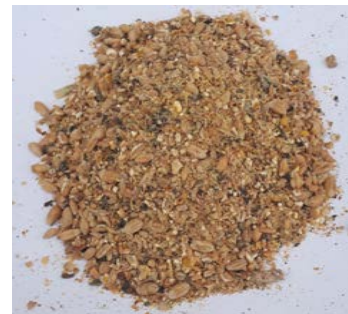
Fig. 10 – Coarse mash feed