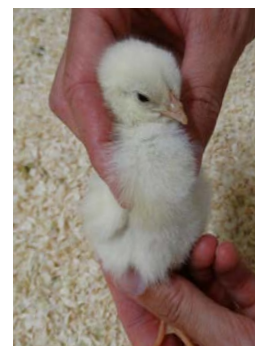
Fig. 7 – Full, soft and rounded crop

>> Eight hours after placement, at least 80 % of the chicks must have their crop full of feed and water (Fig. 7). This has to increase to 96 % about 24 hours after placement. If not, review feed placement, feed quality and water supply and the brooding conditions (temperature, light intensity, chick quality...).