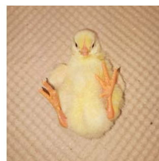
Fig. 4 – Activity

>> A good quality chick is mainly perceived by its activity, some chirping, the absence of respiratory anomalies and a properly healed navel.