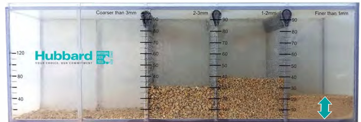
Physical quality of the crumble in the chain feeder after one turn: too much fine particles