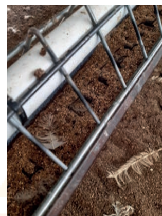
Figure 7: Tube inside the grill