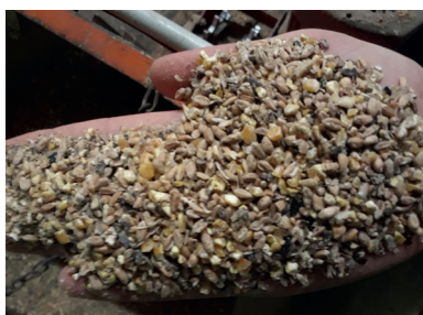
Figure 3: Too coarse feed presentation