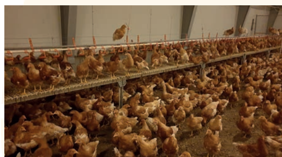
Figure 2: Example of an elevated platform

>> The use of electric wires is not recommended in the rearing house.