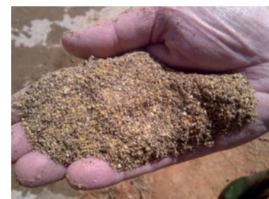
Figure 5: Too fine feed presentation