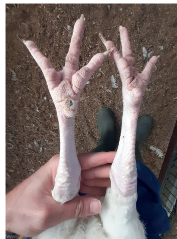
Figure 10: M99 leg condition