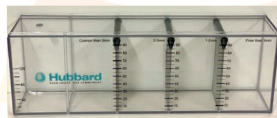
Figure 12: Hubbard Feed Sieve

>> The percentages show the guideline amount in each category of particle size after sieving with screens of 3, 2 and 1mm such as with a Hubbard feed sieve. It is important for all feeds that the percentage of feed passing through the 1mm screen does not exceed the amounts shown. >> Where a sieve with a 0.5mm screen is used then for mash feeds no more than 10% of particles should pass through this screen. >> Please use the Hubbard Feed Sieve Technical Sheet for further information.