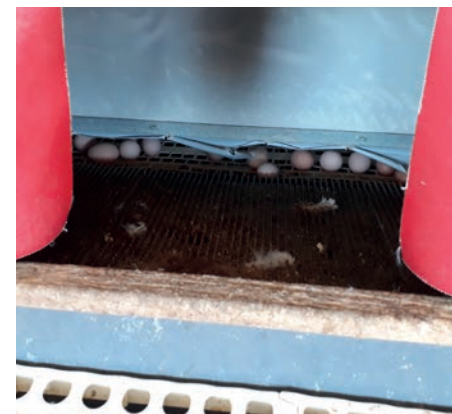
Figure 6: Nest management

>> Make daily checks for the presence of non-laying birds from the peak of lay onwards. Isolate broody hens away from nests in a pen with water and feed for one week. Please refer to The Hubbard Technical Bulletin “Broodiness”.