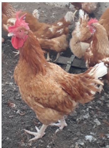
Figure 9: Good I66 attitude