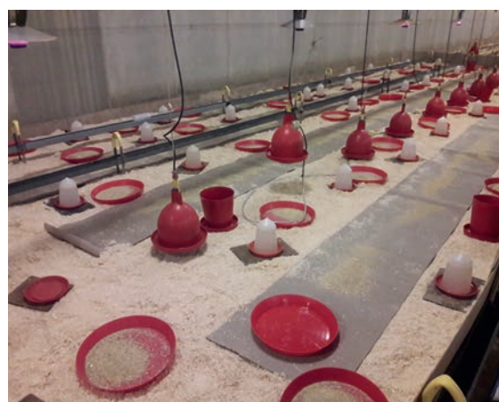
Figure 1: Good brooding conditions