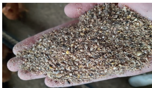
Figure 4: Good feed presentation