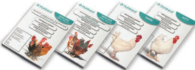
Slow growth - Intermediate growth - M99 - M77