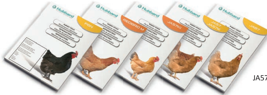
P6N - REDBRO M JA57 Ki - JA57 - JA57 K - JA87