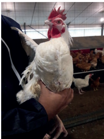
Figure 8: M99 breast condition

>> Male observation and handling is crucial to evaluate their condition (see below Figures 8, 9, 10).