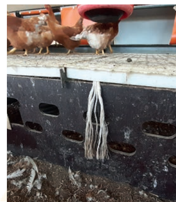
Figure 11: White strings in the production house